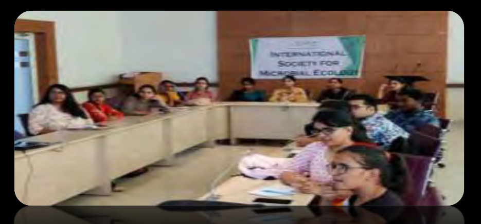
Workshop 1 (October, 2019): Maharshi Dayanand University (MDU), Haryana, India