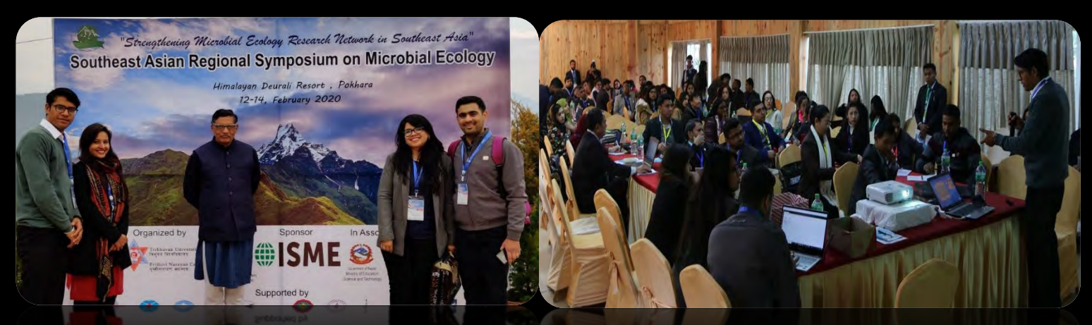
Workshop 3 (February 12, 2020): SARSME-2020, Nepal