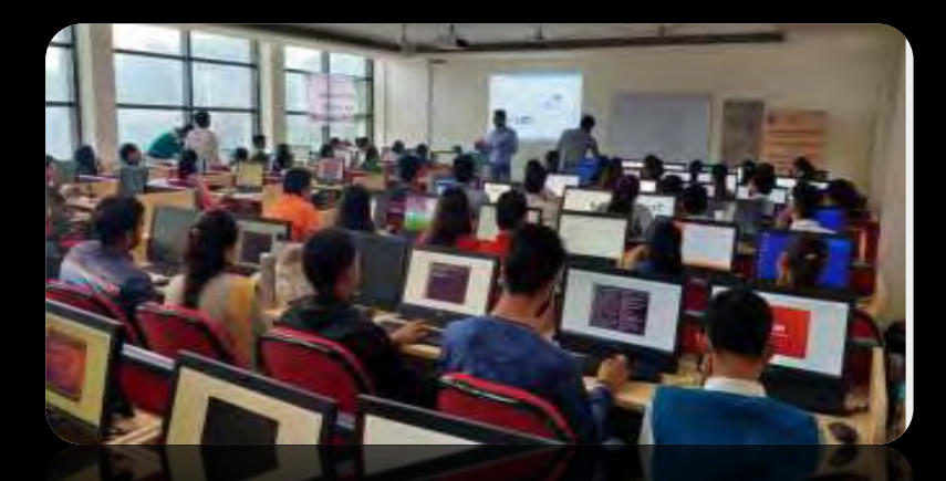
Workshop 2 (November 2019): Central University of Haryana, India